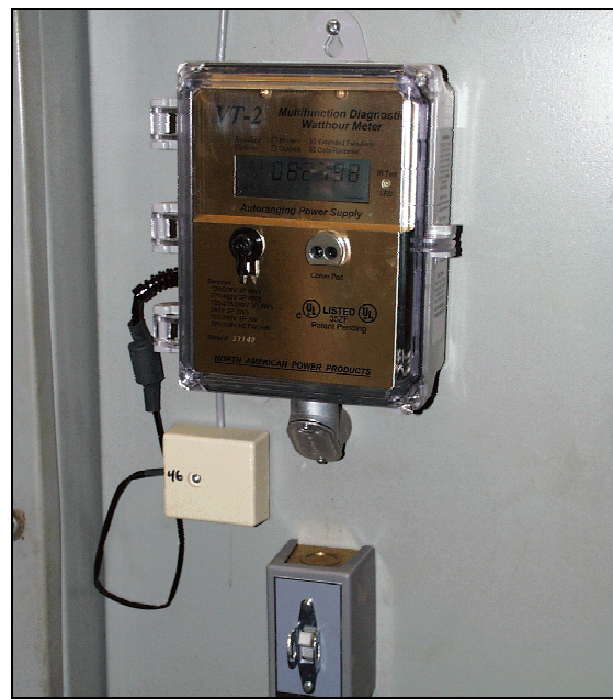
VT-2 RS485 Connection