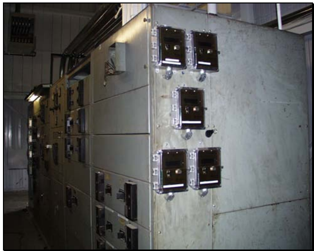
VT-2s Mounted on Switch Gear